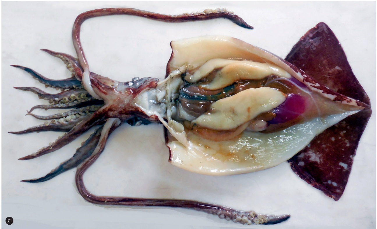
Fig.1. Purple back flying squid, S. oualaniensis a) dorsal view b) ventral view (c) cut open to show flaccid nidamental gland, oviducal gland and ovary